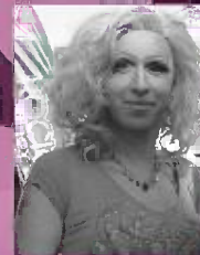
A' LOTTA TRASH MISS NGRA CANDIDATE