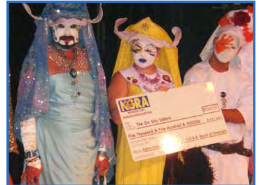
Sin City Sisters accept a check from BigHorn Rodeo 2009 & NGRA

As we start the year I look forward to seeing everyone come out and support NGRA in whatever way you can.