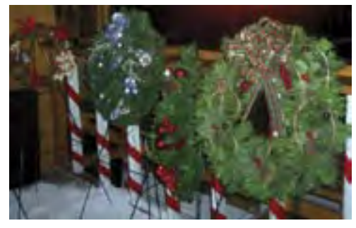
More pictures from our December events on page 5 and 6

NGRA would like to thank all of its members and the many different members of the community who volunteered their time and talent, as well as to all of those who donated items and money to these events. We are truly grateful for your help. Thank you all!