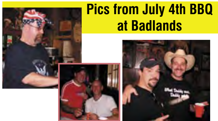
Pics from July 4th BBQ at Badlands

Upcoming IGRA events include IGRA Convention in Calgary (Oct. 20-23) and IGRA Finals in Dallas (Nov. 10-13). NGRA offers a travel stipend to members serving as delegates at convention, so please let a board member know if you are interested in representing NGRA at this important IGRA business meeting.