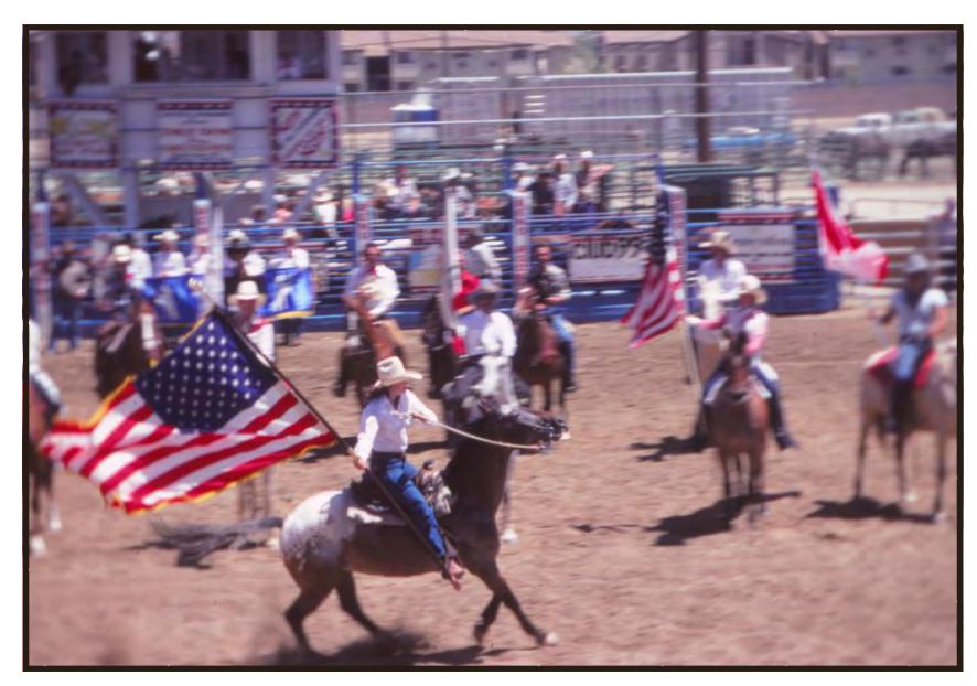
1981 Reno Gay Rodeo

With strength and grace, they forge their way, Celebrating triumphs, a brighter display. In the rodeo's tapestry, their stories unfold, A legacy cherished, a future of gold.