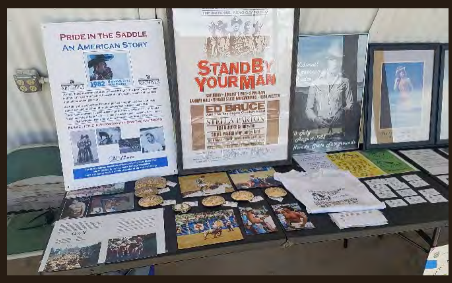
A part of the archives display at the 2021 Zia Regional Rodeo in Santa Fe, NM

As these file boxes have been scanned the original hard copies have been donated to "ONE National Gay & Lesbian Archives at the University of Southern California (USC) Libraries" (ONE). Many hours have been spent sorting, removing staples, and flattening bent corners to prepare for scanning. Even scanning up to 40 pages at a time, each box has taken about 1.5 hours to scan. The last box should be scanned by the end of August 2023, and soon be delivered to ONE. Researchers have already been accessing the documents that have been donated to ONE.