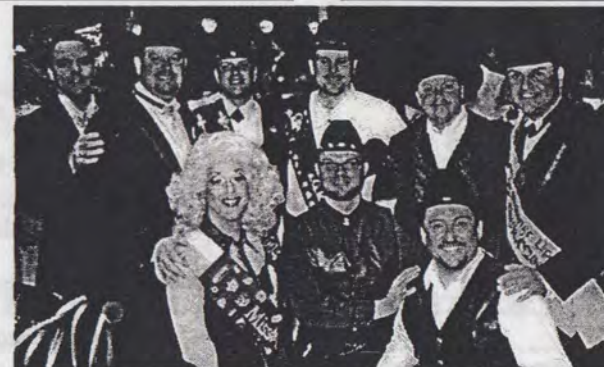
All having a great time at San Francisco Coronation!

Complete competition info, rules, and forms available at www.bayarearodeo.com