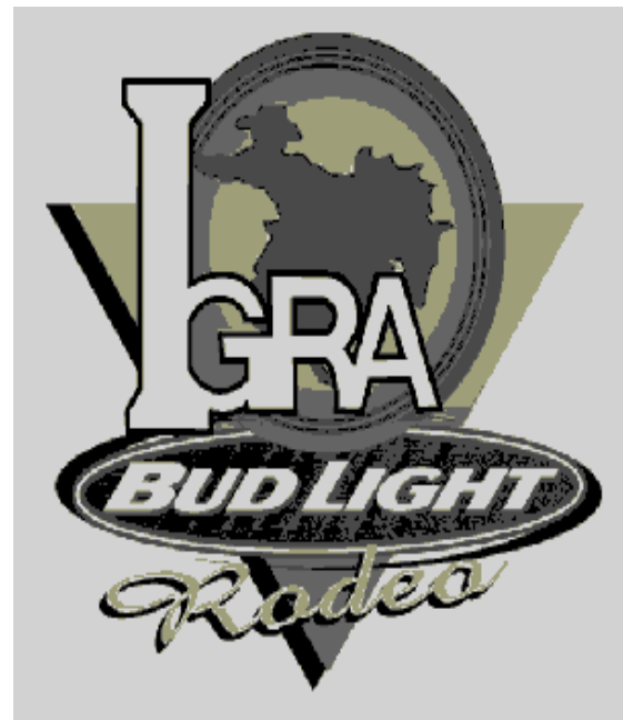
IGRA & Bud Light Sanctioned Rodeos