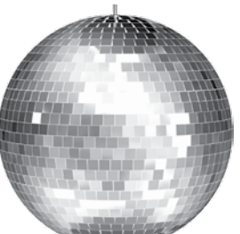
Each bar crawl will have it's own theme, including a 70's disco themed bus!

Rodeo Director, 2018 & 2019 Phone: (602) 510-9671 E-Mail: rtrusley@cox.net