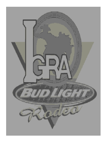
IGRA & Bud Light Sanctioned Rodeos